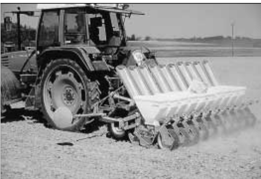
Fig. 2: Planter for equal space narrow row maize planting

17 cm in neighbouring rows, with the planting disks adjusted precisely.