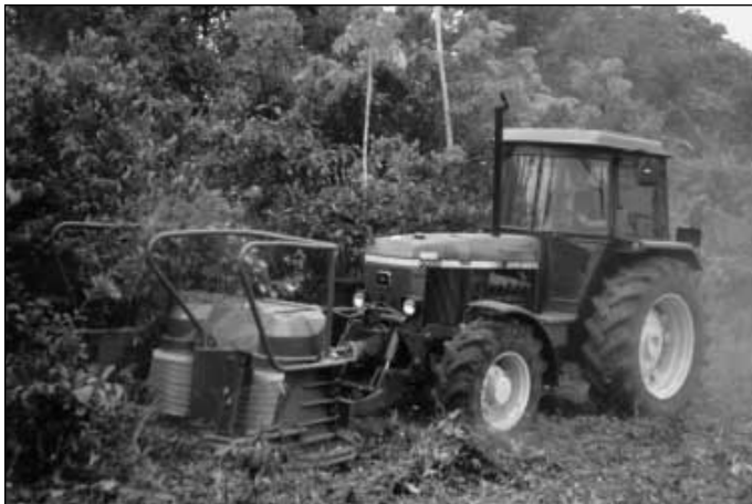
Fig. 1: The Prototype working in a four-year-old fallow vegetation

duction very quickly blocked the tractor radiator sieve so that the sieve had to be cleaned practically every 10 minutes to avoid engine overheating. In the same way, the air intake filter was subject to great amounts of dust which brought with them very short service intervals.