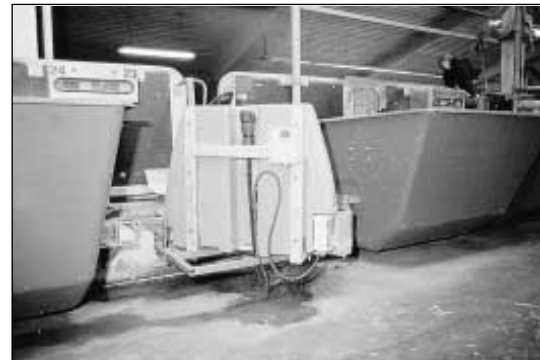
Fig. 1: Integration of the heated storage drinker into weighing technique and data acquisition of the experimental unit for registration of roughage intake (Experimental station for livestock biology and ecological farming „Meiereihof“)

Involved were a maximum of 20 dairy cows (German Holstein) each with an average daily yield of 25 kg. The animals were housed in a naturally ventilated cubicle building with built-up cubicles and slats. They were milked twice daily in a 2x3 auto-tandem parlour and fed a modified TMR plus additional concentrates per transponder from two self-feeding boxes. TMR components were maize and grass silage, hay (first and second cut), supplemental feed and soya pulp. Ration dry matter and energy content was 47.1% and 5.7 MJ NEL in the first trial, 46.2 and 5.6 MJ NEL in the second, 41.6% and 5.6 MJ NEL in the third and 42.7% and 5.5 MJ NEL in the choice trial. The concentrate feed contained 8.3 MJ NEL/kg DM; this was fed according to yield (9 kg milk from ground rations). The individual troughs with compu-