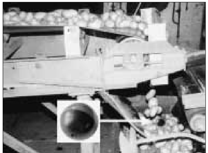
Fig. 1: Determining real mechanical stress in handling and marketing facilities

For the precise time-associated application of mechanical stresses on potato samples, the ATB had the use of a stress simulator in the form of a vibration box through which the stress profile is able to be given in a reproducible way through the vertical lift (crankdrive), frequency and load period. In future, a servo-hydraulic test stand will also be able to be used to apply individual verti-