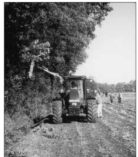
Fig. 3: Coppice trimming in embankment