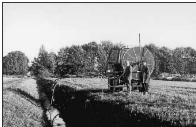
Fig. 1: Drainage flushing equipment in operation

Maintenance of running waters, landscape care, drainage flushing, machine demonstration