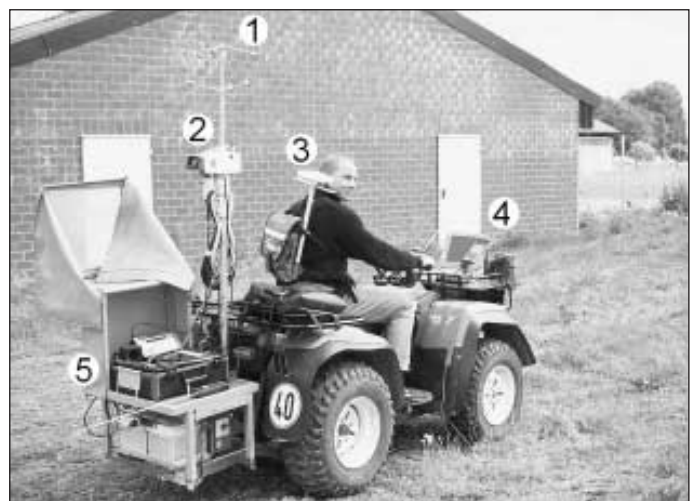
Fig. 1: Vehicle for mobile tracer gas measurement; 1. Ultrasonic anemometer; 2. SF6-tracer gas measurement instrument; 3. GPS position receiver; 4. Data recording and storage; 5. Electricity supply and tracer gas basic instrument.

In the collection of test data, all meteorological, topographical and data from the emission side which have an influence on the spread occurrence have to be recorded. These data represent the model input in simulation calculations. Complementary to this, the pollution side data which are compared with the results of the simulation calculation, have to be recorded.