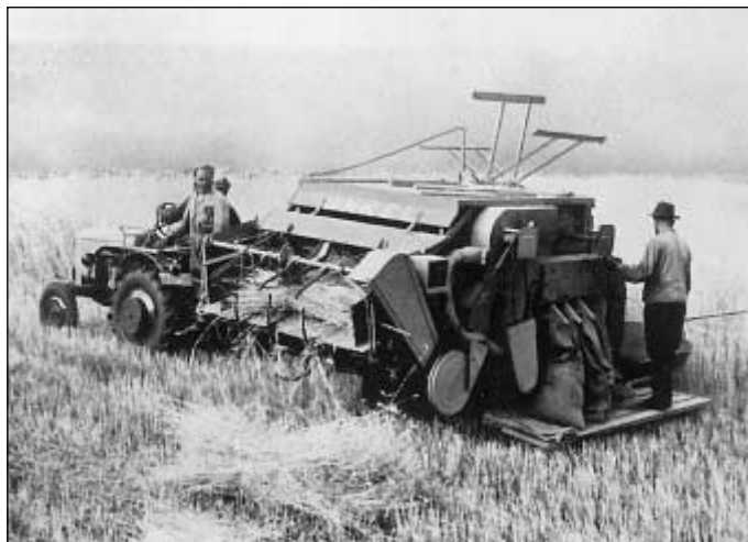
Fig. 4: The small Unkel combine „Piccolo“ at work in 1952.