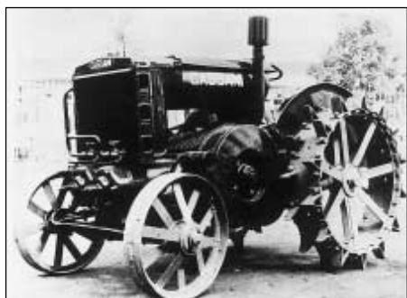
Fig.3: Cassani diesel tractor from 1927

100 years ago academic involvement in farm machinery was moving into a golden period. At the Agricultural University in Berlin the