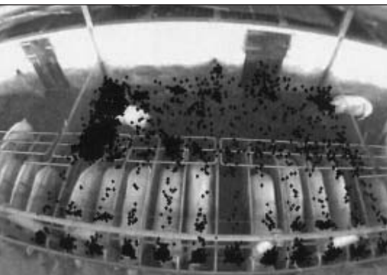
Fig. 1: Video image with xy-coordinates of all animals taken over 48 hours in pen 1

Altered legal regulations require loose housing of sows in groups and more space per sow in dry sow accommodation. This increases the advantages of simple, cost-efficient production systems. In a practical trial the behaviour of pregnant sows in a natural climate house with lying huts was recorded. Here it could be observed that the production system investigated fulfilled requirements with, however, special values having to be used when considering the grouping of the sows.