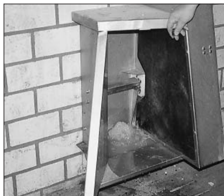
Fig. 1: No-gate transponder feeding station.

In total, the sow groups gave the impression of being very quiet. It is only with difficulty that any feeding problems can be recognised