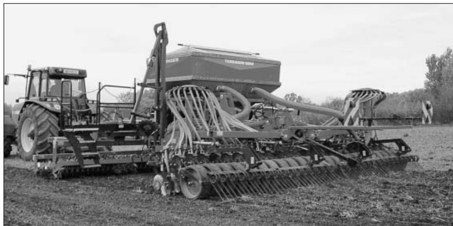
Fig. 1: Pöttinger presents at the Agritechnica the new mulch seeding combinations Terrasem 3000 T and Terrasem 4000 T with 3 m and 4 m working width

In mulch seeding and zero tillage, a wider application of known standards can be discerned. In combination with tillage implements, universal concept solutions are offered which have a larger capacity and save work steps. The trend towards larger working