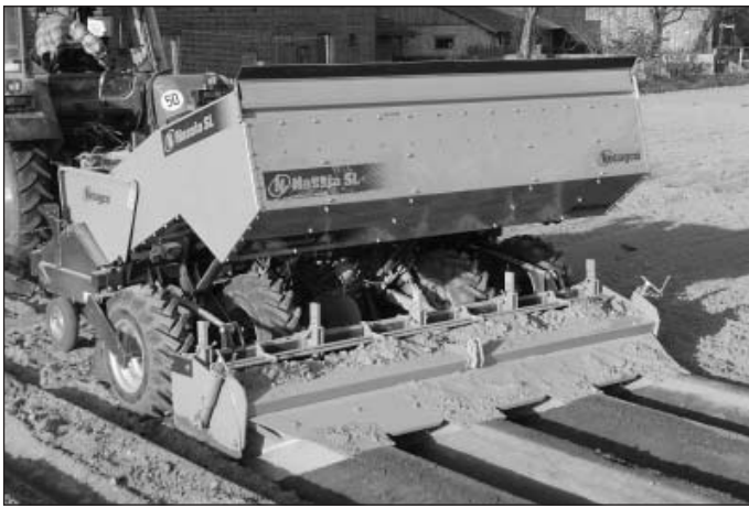
Fig. 2: The combination of potato planters and ridging implements saves working time

area capacity resulting from the use of drawn four-row units with larger hopper capacities or transition to six- and eight-row planting machines. However, the comprehensive utilization of the capacity potential of both solutions requires an adapted logistics concept and in particular quick filling of the planters at the field's edge. On sloped fields, the lower directional stability of drawn planters must be taken into consideration, which makes the development or adaptation of suitable guiding systems seem useful. In addition, only some of the drawn planting machines for road transport feature their own drill transport system or a solution which allows the outer planting units to be folded in.