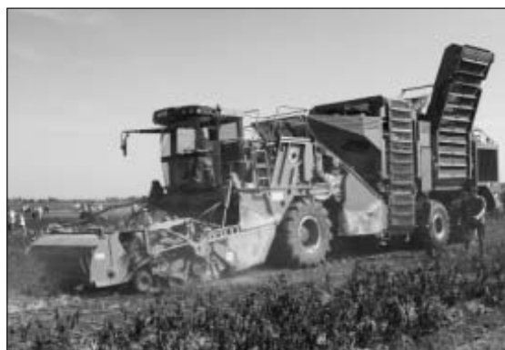
Fig. 3: Self-propelled four-row potato harvesters require adapted logistic concepts

In recent years, many manufacturers have intensified the development of self-propelled two- and four-row harvesting machines. Apart from a basic demand in certain regions generally characterized by difficult harvesting conditions, the demand is more weather-dependent. For this reason, the manufacturers are trying to limit the additional expenses caused by self-propelled machines by using as many units from drawn machines as possible and to improve the capacity- and quality-oriented adaptation of the machines with the aid of fully hydraulic drives. The two manufacturers of self-propelled four-row bunker-hopper harvesters profited from the experiences of the last two harvesting campaigns for the optimization of individual units and an improvement in built-in harvest-management systems. In addition, accompanying studies enabled the logistic conditions for self-propelled potato harvesters to be determined more precisely and the effects on the harvesting costs to be established in a practice-oriented manner.