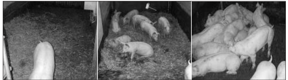
Fig. 1: Flat littered floor (left), deep littered floor (middle), slatted concrete floor (right)

The floor characteristics are a decisive factor in assessing the animal welfare in a pig house. Therefore, through selected experiments the flooring types required by fattening pigs in housing systems were to be determined and the possible correlation between the floors selected and house air temperatures checked. Of the floorings investigated the slatted concrete floor was the first choice, followed by the deep-littered floor and the flat littered floor was third.