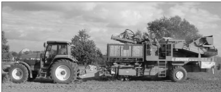
Fig. 1: Direct box filling on the harvester

To reduce mechanical stress on potatoes from harvest to storage and to attain improved potato quality in long-time storage, a new method for box filling on the harvester was developed. By using selected criteria, this new method, which is called direct box filling, was compared to two traditional methods.