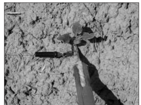
Fig. 3: Measuring stick with hung in cable

a complete measuring device is now available. With this system it is possible to test single seed planters and seed drills for grain spacing in the laboratory and the plant spacing in the field. The determination of the grain spacing in the laboratory and the plant spacing in the field are important criteria for the work quality evaluation of different planting machines. With this system it is possible to evaluate new equipment and also optimise new equipment in the construction phase.