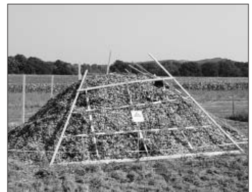
Fig. 1: 70 m 3 pile at the edge of a poplar field

The average temperature in the wood chip piles shows a characteristic course. Directly after storage it increases rapidly and reaches its maximum value of 60 °C after 10 to 30 (50) days. This value is to a large extent determined by the bulk volume, surface area, surrounding temperature and particularly by the size of the wood chips. After 100 to 150 days (end of January) the temperature reaches a clearly lower value and after that successively decreases to the ambient temperature [1]. The reason for the increase in temperature is the heat produced from the respiration of the sap wood cells which are still alive (< 40 °C), and due to the activities of micro organisms, particularly of the fungi (< 60 °C) and bacteria (< 70 °C).