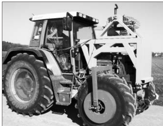
Fig. 1: Research tractor with with mounted shaker device

Literature references can be called up under LT 07517 via internet http://www.landwirtschaftsverlag.com/landtech/local/literatur.htm .