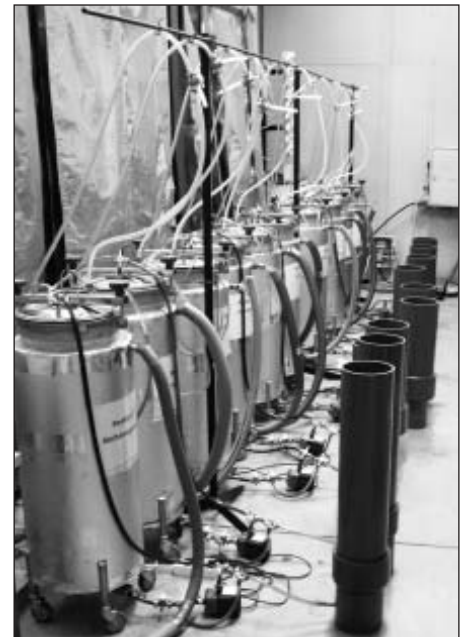
Fig. 1: Test biogas plant for solid substrates of the University of Hohenheim

Taking into account the above mentioned facts, the optimum growth requirements of