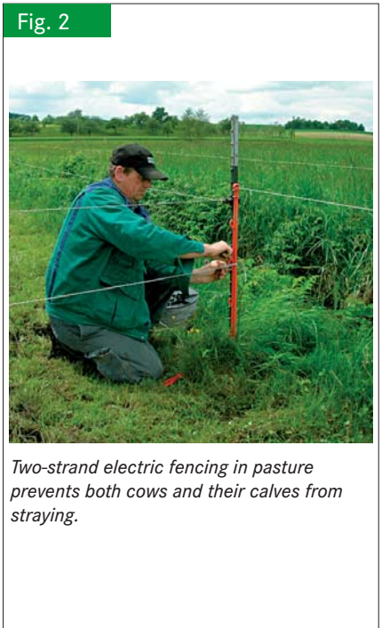
Two-strand electric fencing in pasture prevents both cows and their calves from straying.

Version 1 shows a mobile fence typical used for dairy cows, version 2 is to be found on suckler cow farms frequently. Version 3 is used with geese. With these procedures of building of fences supposed two workers use in the version 1 and 2 a reel attached at the tractor, in version 3 a hand reel. The distances between farm and the plot are not considered in the present calculation. Figure 3 shows that with increasing length of the fence working-time requirements decreases per running metre fence, however is another decrease hardly to be ascertained from about 1500 m