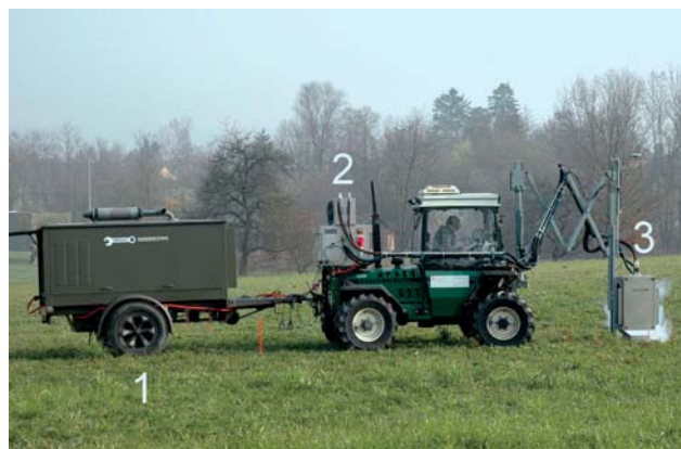
Self-propelled microwave-prototype. 1 = generator, 2 = high-voltage unit with cooling fan, 3 = hydraulic adjustable head with magnetrons and waveguide exits.

that with permanent heating ( F_{1,25} = 6.26 , p = 0.02 ). When heating time was increased by one second, the plant mortality rate rose by approximately 3 % ( F_{1,25} = 122.78 , p < 0.001 ).