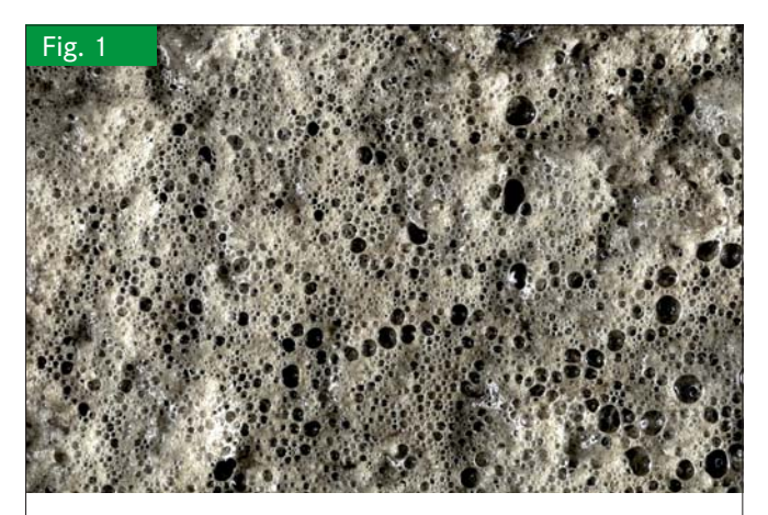
Foam can be a problem in biogas plants.

A great number of biogas plants have been commissioned in Germany in the last decade as part of the promotion of renewable energies. Biogas can be utilized in many different ways. It is a very suitable component in the energy mix of renewable energy sources. After being processed, it may be used as a fuel or for the generation of heat. Considering that biogas plants often operate at the limit of efficiency, technical problems and process upsets that involve long downtimes and repair costs can have serious economic consequences for the operator of a biogas plant. An investigation of ten selected plants in the German state of Mecklenburg-Vorpommern showed that the formation of foam (Figures 1 and 2) in the reactor is one of the major causes of process upsets in biogas plants [1]. The American Society of Civil Engineers also reports that the formation of foam in digestion towers is a persistent problem for the operators of wastewater treatment plants [2]. The German federal research program (Bundesmessprogramm) for the evaluation of biogas plants has also reported on problems due to foam formation [3]. Hence, it is important to investigate the reasons for the formation of foam and to find suitable measures to prevent and counteract foam formation in biogas plants.