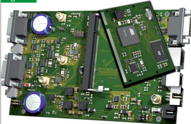
LaSeKo-Box main board and interface circuit board [2]