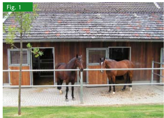
Fig. 1 Paddockbox

The 12.50 m wide stable building is of traditional steel frame construction supporting a 22° slope gable roof of corrugated fibre-cement sheets with outer walls of unplastered agricultural brickwork.