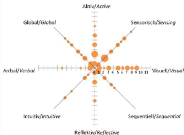
Learning style preferences of the students (n = 32) [4]

ing and learning style of students and teachers do not match, there will be problems: students lose interest in the course and perform poorly in the test [5].