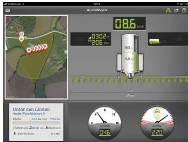
Combined view of machine data, task data and map view during the spreading process