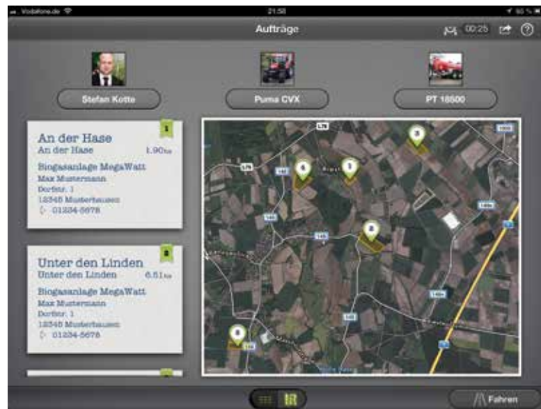
Example for tasks with the belonging fields