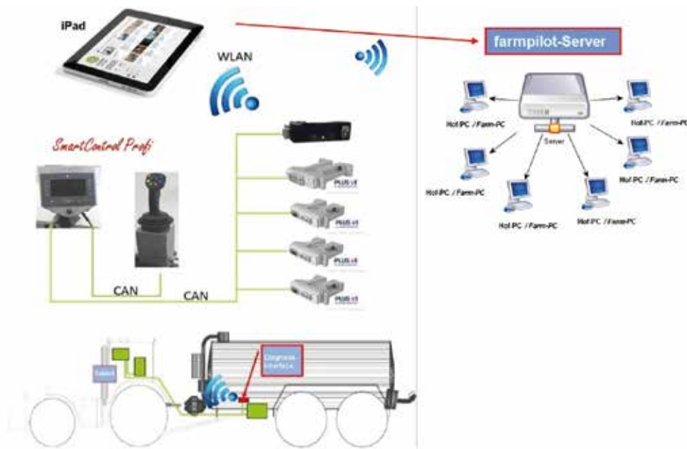
Basic structure SmartControl for iPad (SCI)

In case no Farmpilot connection is available, all assignment data can be directly entered on the iPad. Either there is already stock data available or they are directly entered by the user. Hereby, the designation of the field is given using Geofence points. In the same way, entrance points to the fields, certain meeting points etc. are determined. Figure 2 shows the map display of five sample assignments in the way it is seen on the iPad by the driver. On the screen's left-hand side, the corresponding task data is visible. In the upper row, the chosen allocation of the tractor, the liquid manure trailer and the driver is shown. Finished work tasks are saved locally and, if so desired, sent to the client or back to the Farmpilot-portal via email.