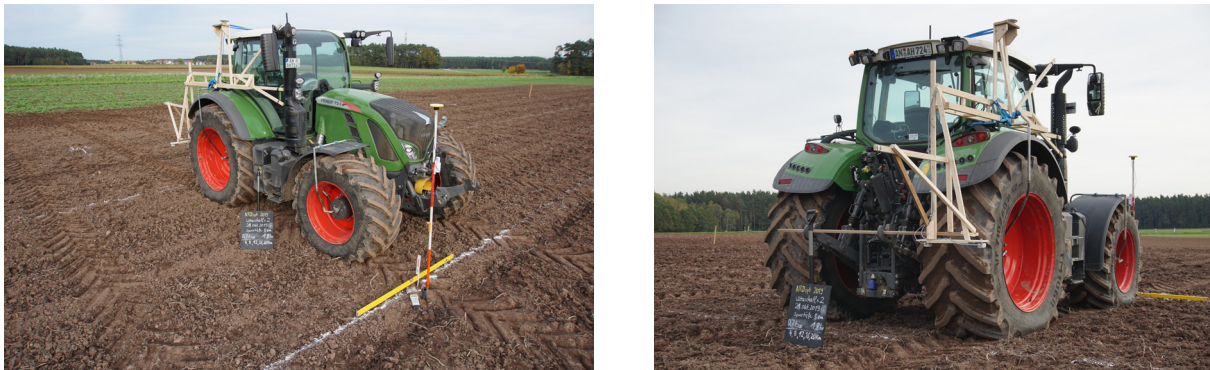
Figure 2: Measurement setup for recording the reference values of track depth and soil moisture at a measurement point (left); ultrasonic sensors and the action camera on a framework behind the tractor record the track depth, which was georeferenced with a GNSS receiver (right)

In measurement campaign 1 , the track depth was measured in three areas of the field with different soil moisture. In area 1 (low soil moisture, see Table 1) and in area 2 (high soil moisture, see Table 1) the tire pressures of 0.7 and 1.8 bar were combined with the driving speeds of 4, 8, 12, 16 and 20 km/h. In area 3 (medium soil moisture), tire pressures of 0.4 and 2.0 bar were compared at speeds of 4, 8, 12, and 16 km/h. The tire pressures of 0.7 and 1.8 bar were combined with the driving speeds of 4, 8, 12, 16, and 20 km/h. The tire pressures were set on a Fendt 724 (tires: TM1060, Trelleborg, Sweden, VF 600/60R30 front, VF 710/60R42 rear) before the measurements with a tire pressure system (Reifenregler automatic, Steuerungstechnik StG, Germany). Inexpensive ultrasonic sensors and an action camera were used as sensors for recording the track depth. The measured values of the sensors were checked for normal distribution and a variance analysis was carried out with the program RStudio v1.2 (package 'aov', Chambers et al., 1992). Subsequently, the influence of the tire pressure within each experimental setup was evaluated with the Students t-test (Park and Wang 2018).