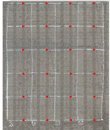
Figure 1: Aerial view of the test facility after measuring the track depths; tire pressures of 0.5, 0.7, 1.8 and 2.0 bar at a constant driving speed of 4 km/h were compared; the horizontal lines mark the reference points

During the first measurement campaign, the track depth was measured with two low-cost ultrasonic sensors HC-SR04 with a measuring range of 20 to 4000 mm, a resolution of 3 mm, an accuracy of 99.8% and a measuring angle of 15^\circ (ElecFreaks, China). The ultrasonic sensors were mounted behind the tractor centrally above and beside the track at the same height of 97 cm (measured from solid ground at a tire pressure of 1.8 bar). Connected to an Arduino Mega 2560 microcontroller (Arduino AG, Italy), the track depths were calculated from the difference in distances recorded by the sensors in the middle of the track and next to the track at a data rate of 9 Hz. For the validation of the measured track depths against the reference values, the measured track depth was processed by averaging within 0.5 and 3 m from the position of the reference.