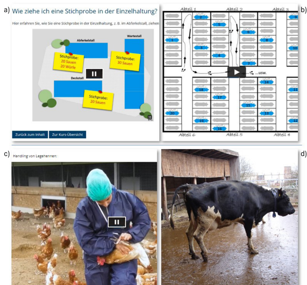
Figure 1: Exemplary contents from the “Animal welfare indicators” online training module: a) and b) film explaining sampling for sows & suckling piglets, c) film with tips on animal handling for young/laying hens, d) photo for lameness indicator, dairy cow

The live and online training modules contain identically structured courses on how to collect the animal welfare indicators for the livestock categories “dairy cows and calves”, “beef cattle”, “sows and suckling piglets”, “weaning piglets and fattening pigs”, “pullets and laying hens”, “broiler chickens” and “broiler turkeys”. The modules start by presenting the most important facts about on-farm self-assessment with a short video clip, amongst others. They then provide information on implementation, sampling, animal handling and continues with lessons on each animal welfare indicator. For all indicators, the lessons contain detailed background information on the respective animal welfare problem, method descriptions including illustrated classification tables (Figure 1). Furthermore, each course includes exercise (photos and videos) with an integrated feedback function. In this way, users can practise for the online test (ZAPF et al. 2021).